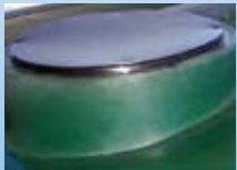
Algae-free cover top