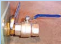
Brass outlet and valve